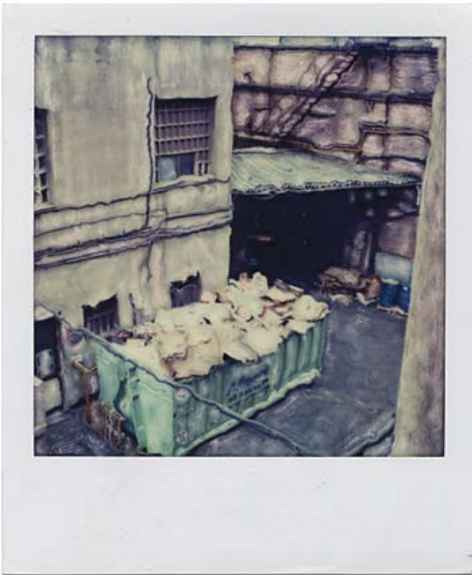
"Outside" Polaroid SX-70 Manipulation Filippo Centenari, 2005