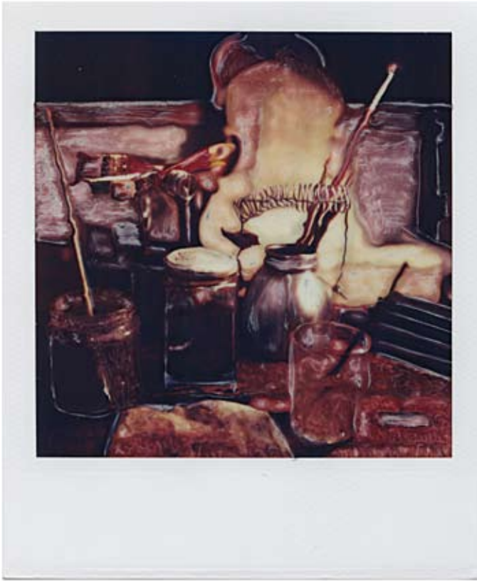
"Untitled" Polaroid SX-70 Manipulation Filippo Centenari, 2005