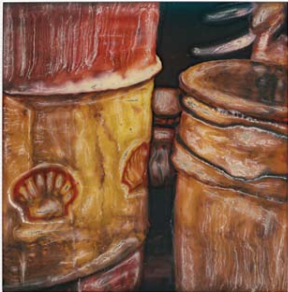
“Shell” Polaroid SX-70 Manipulation Filippo Centenari, 2005