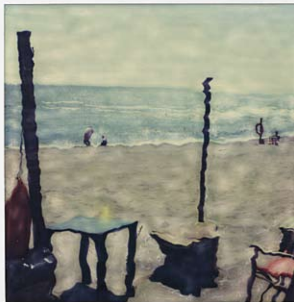
“Last beach” Polaroid SX-70 Manipulation Filippo Centenari, 2005