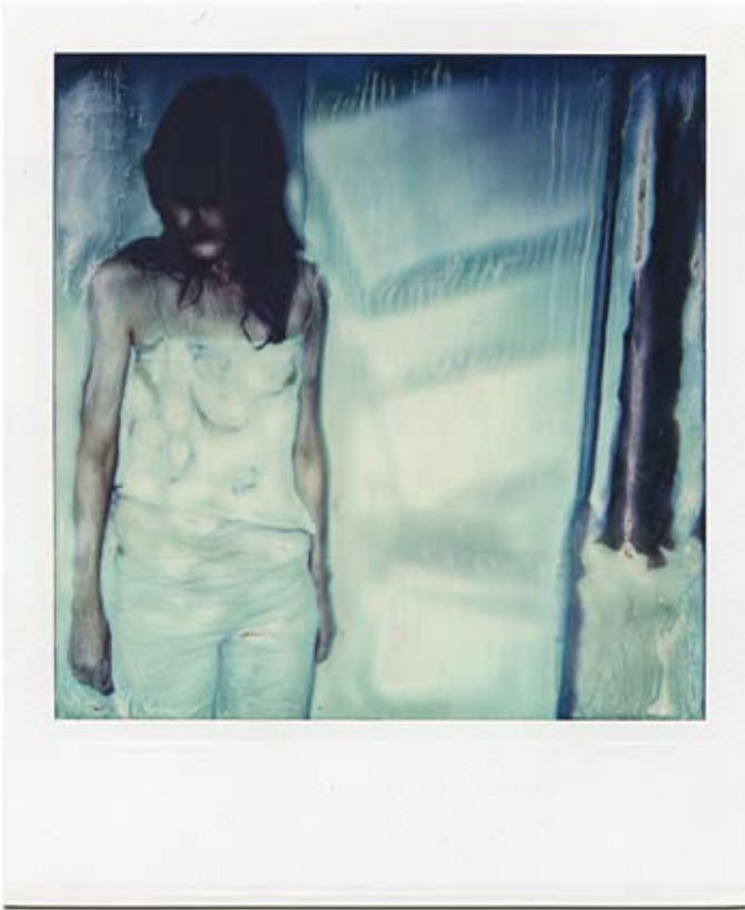
"Conscience" Polaroid SX-70 Manipulation Filippo Centenari, 2005