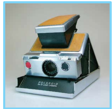
Polaroid SX-70 SLR Camera Available at unsaleable.com