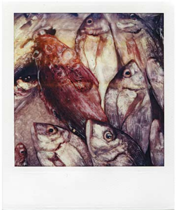
"Fish" Polaroid SX-70 Manipulation Filippo Centenari, 2005