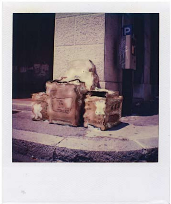
"Lost packages" Polaroid SX-70 Manipulation Filippo Centenari, 2005